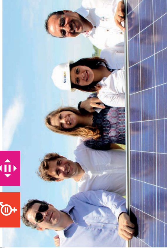
(1) As at 31/12/2020

In addition, each country will choose a specific local initiative in relation to workplace diversity and/or its environmental footprint.